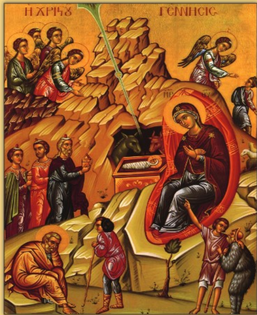
Icon of the Nativity of Our Lord — December 25th